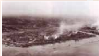
Kawasaki Steel Corporation: Construction of Chiba Steelworks (Chiba Prefecture) (currently JFE Steel Corporation)

Modernization of steelmaking through construction of the first postwar blast furnace