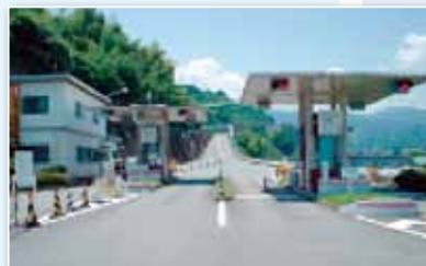
Toyo Tires Turnpike (formerly the Hakone Turnpike) DBJ established Japan's first infrastructure fund in collaboration with Australian investment bank Macquarie Bank, involving equity investment to facilitate business transfer transactions for the former Hakone Turnpike.