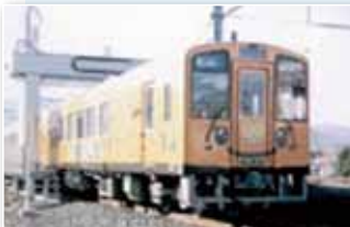
The Former Niigata Tekkosho Co., Ltd. Through such methods as DIP financing, mergers and acquisitions, and business revitalization funds, DBJ supports local companies, helping communities maintain excellent supplies of technical expertise and employment opportunities.