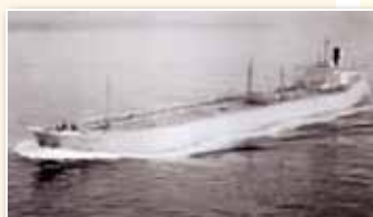
Kawasaki Kisen Kaisha, Ltd.: The Tōnegawa Maru tanker

Promotion of the synthetic fiber industry