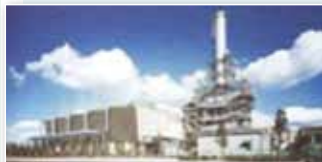
Nakayama Joint Power Generation Co., Ltd.: Independent power producer (IPP) power generation operations (Osaka Prefecture) In step with relaxation of regulations, project finance support for Japan's first steelmaker to enter the power generation business