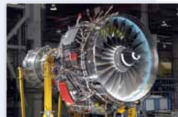
V-Lease Corporation By applying the expertise it has cultivated to date, DBJ entered the business of operating leases for aircraft engines, of which core parts are produced by Japanese companies involved in heavy industry. Through this business, we aim to promote the further development of the Japanese airline industry.