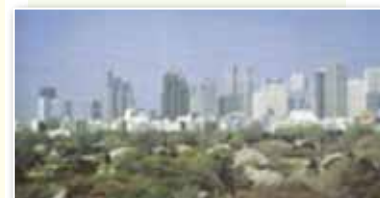
Shinjuku new urban center: Shinjuku Mitsui Building and others (Tokyo)

Promotion of home-grown technologies through commercial application of new technologies