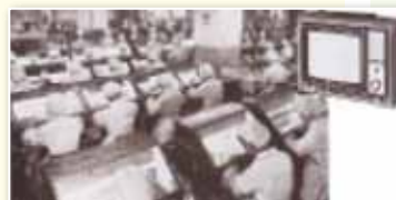
Sony Corporation: Trinitron color television factory

Promotion of home-grown technologies through commercial application of new technologies