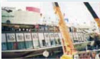
Hankyu Corporation: Earthquake reconstruction work (Hyogo Prefecture) Recovery work on traffic infrastructure destroyed by earthquakes