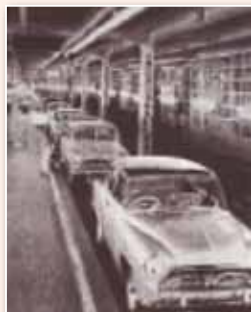
Toyota Motor Corporation: Modernization of facilities through procurement of imported machinery (Aichi Prefecture)

Modernization of steelmaking through construction of the first postwar blast furnace