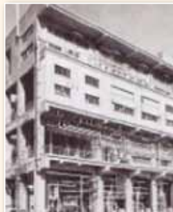
Asahi Chemical Industry Co., Ltd. (currently Asahi Kasei Corporation): Construction of the Fuji Plant for production of Cashmilon acrylic staple fiber (Shizuoka Prefecture)

Promotion of the synthetic fiber industry