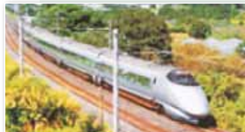
Yamagata JR Chokko Tokkyu Holdings: Yamagata Shinkansen Improvements to regional railway infrastructure

October 1, 2008: Development Bank of Japan Inc. established