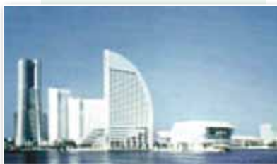
Pacific Convention Plaza Yokohama: Pacifico Yokohama (Kanagawa Prefecture) Construction and maintenance of hotels, international conference facilities, etc., in the Minato Mirai 21 area of Yokohama