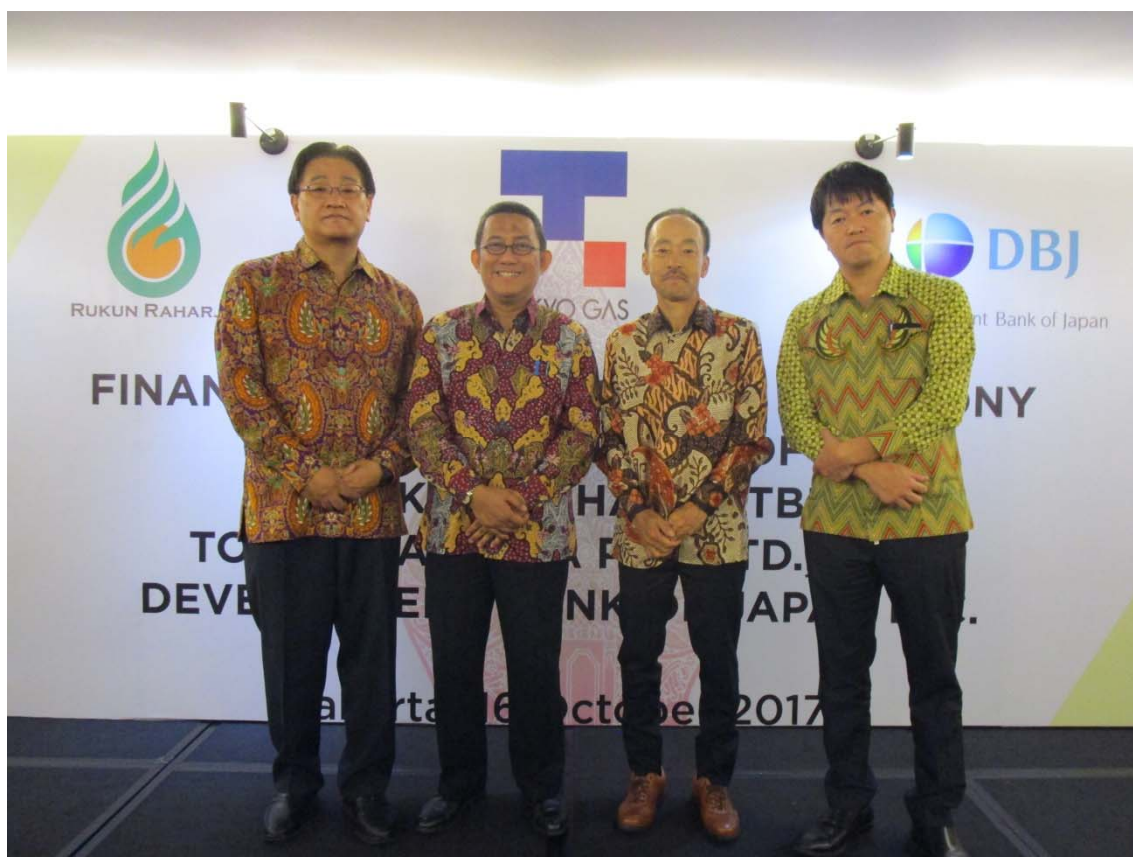
Picture from Closing Ceremony