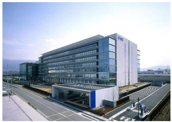
•Hirooka Office (Innovation Center) Converts 100% of electricity used at domestic sites into renewable energy.

* The number (30%) was determined by calculating the weight of recycled plastic in each part based on the composition rate and then adding them up.