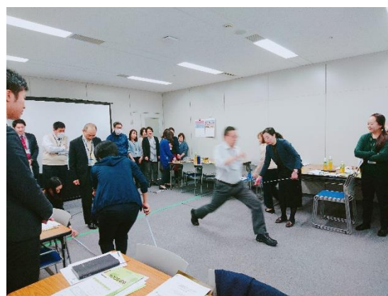
A Nichirei Health Promotion School session at the company’s Tohoku branch