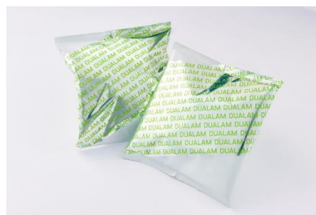
Soft packaging made with DUALAM, a non-solvent, rapid-hardening adhesive (Winner of the Japan Packaging Institute’s 46th Kinoshita Award for packaging technology)