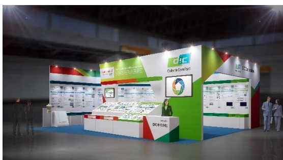
The company’s products at the 2022 Sustainability Exhibition(SUSMA)

(3) DIC pays close attention to the sustainability of its supply chain, addressing risks involving human rights through due diligence while reporting to its clients the findings of sustainability analyses and evaluations and engaging them in discussions on possible improvements.