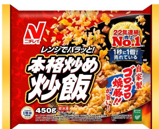
“Honkaku Itame,” Nichirei’s flagship product