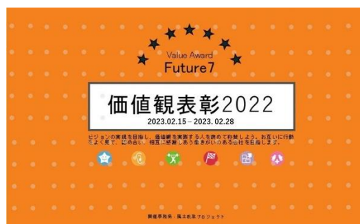
Employee Good Value Awards