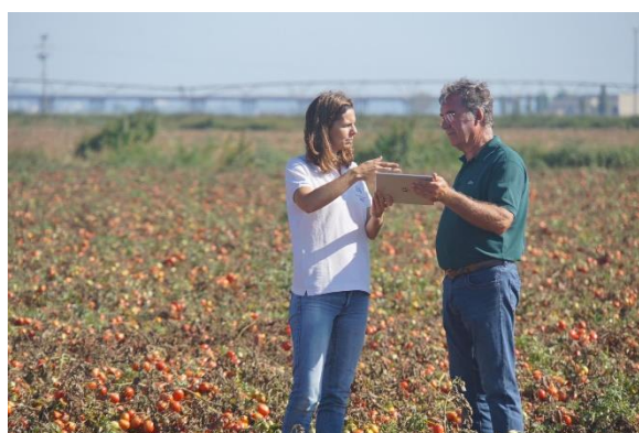
An agricultural advisor using a device to give guidance to a producer